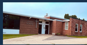
Farley Campus 6th - 8th grade

WITH THE PASSING OF EDUCATION SAVINGS ACCOUNTS, SETON CATHOLIC IS NOW MORE AFFORDABLE THAN EVER!