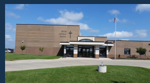
Peosta Campus Preschool - 5th grade