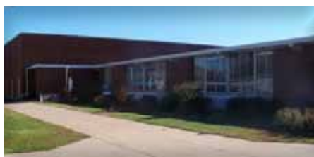
FARLEY CAMPUS 210 2nd Avenue SE