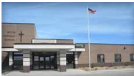
PEOSTA CAMPUS 7597 Burds Road

The Seton Catholic School Faculty and Staff believe in seeking excellence through a Christ-centered education in a faith filled community so all students can grow spiritually, emotionally, and academically as life-long learners in a global world.